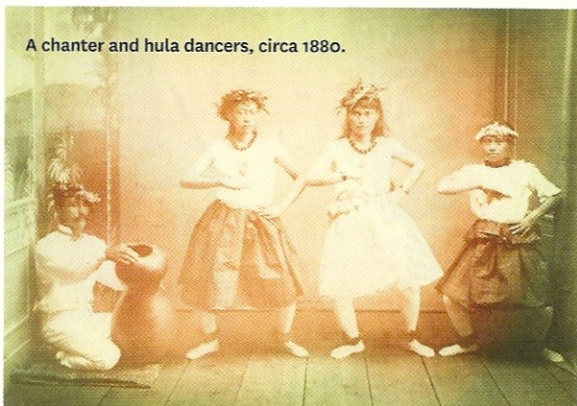
A chanter and hula dancers, circa 1880.