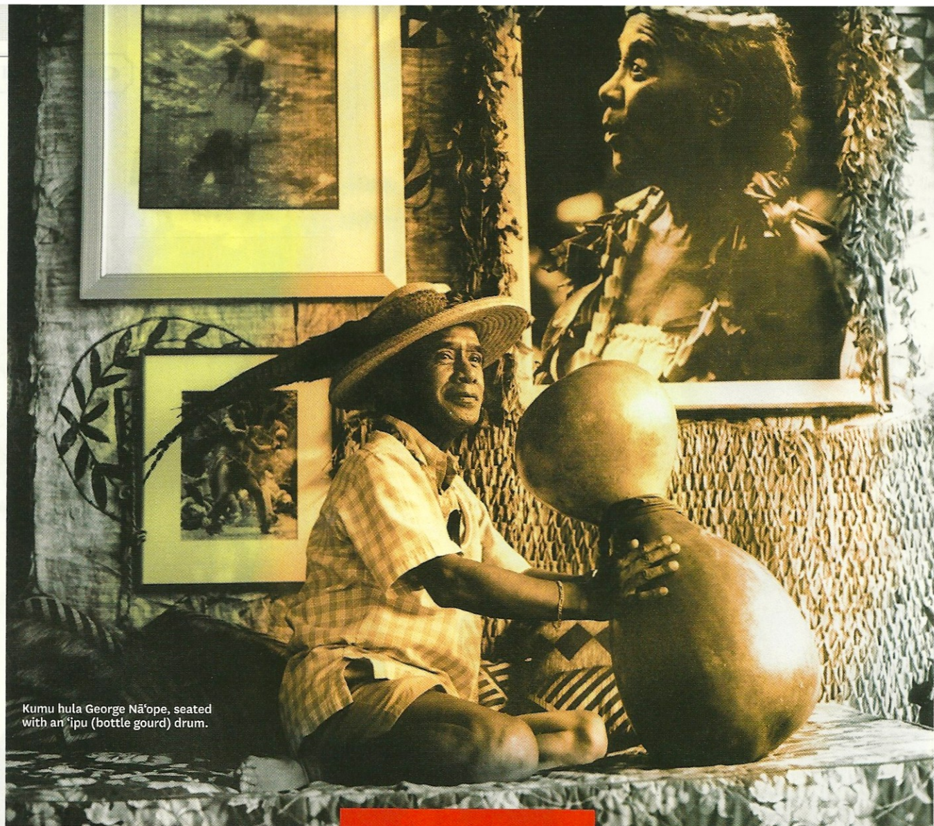
Kumu hula George Nā'ope, seated with an 'ipu (bottle gourd) drum.